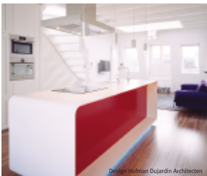
Design Hofman Dujardin Architecten