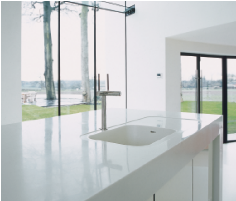
Design Ellis Williams Architects

Give it a distinctive flavour with Corian®.