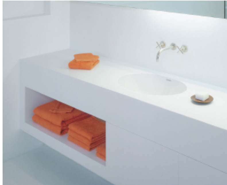
Design Sofie Lewyllie