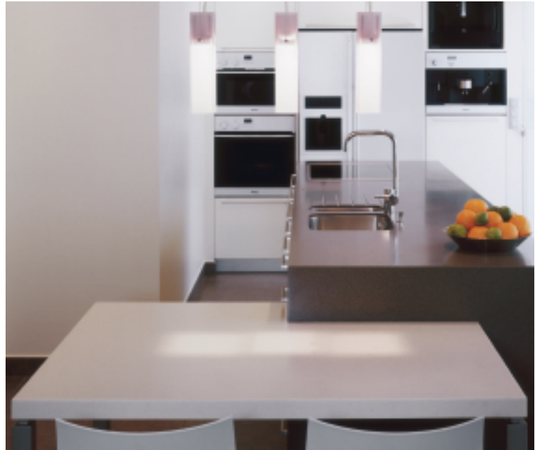
Design Sofie Lewyllie