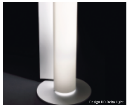
Design DD-Delta Light