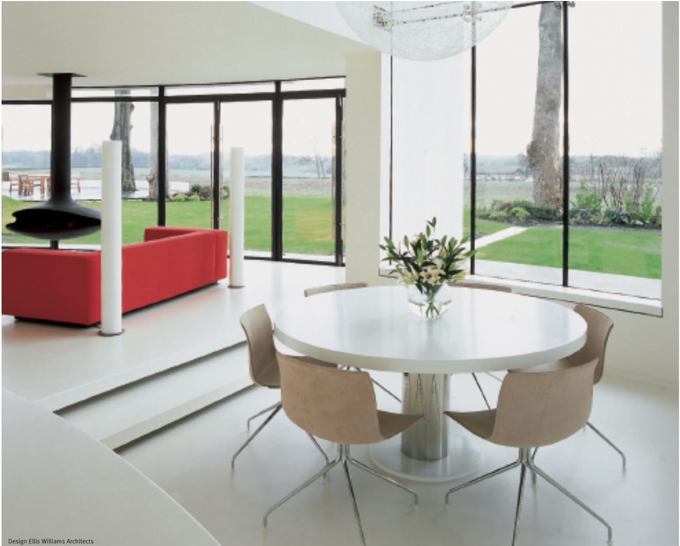
Design Ellis Williams Architects