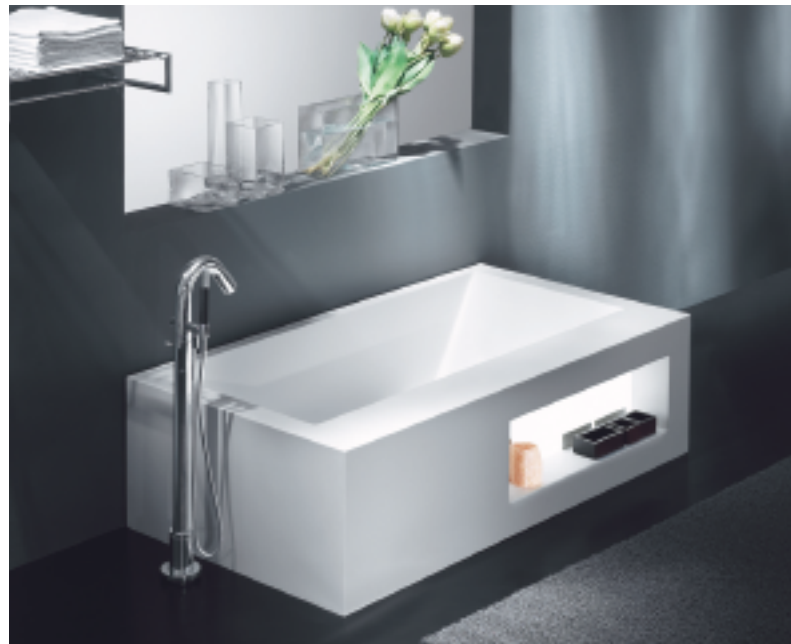
Design Giampiero Peia/Cisal