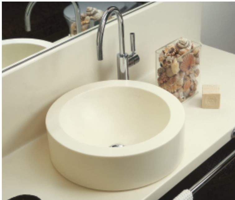
Design Massimo Fucci