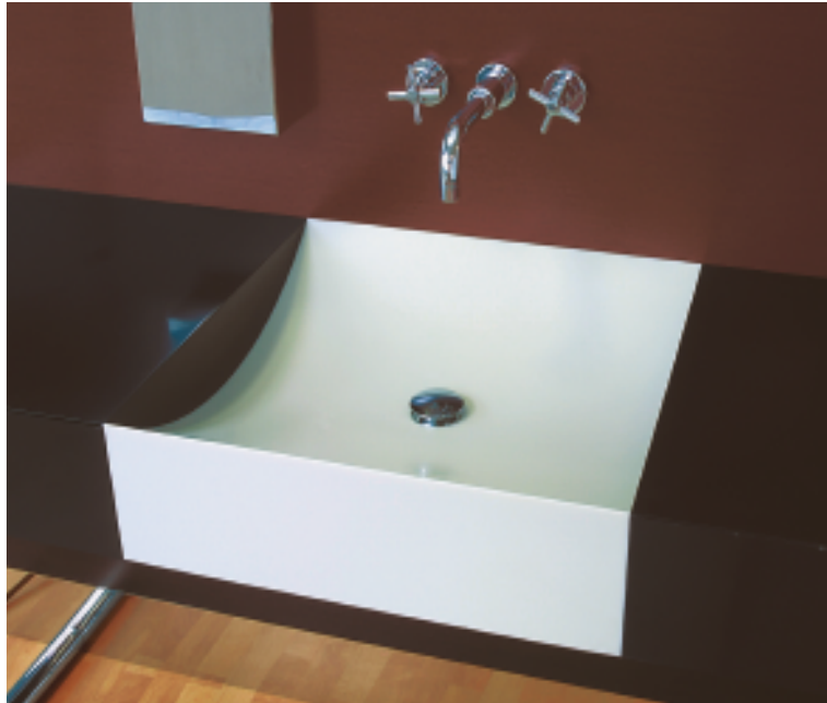
Design Massimo Fucci

It's your bathroom. Make waves with Corian®.